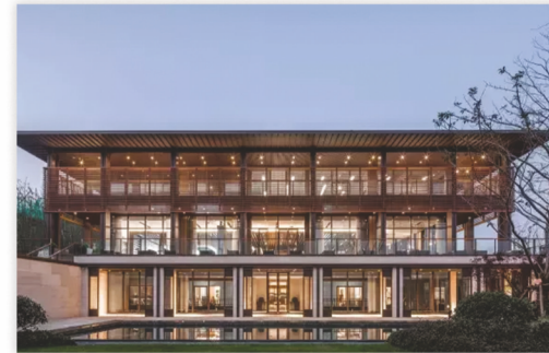
*INDICATIVE PICTURE OF CLUBHOUSE