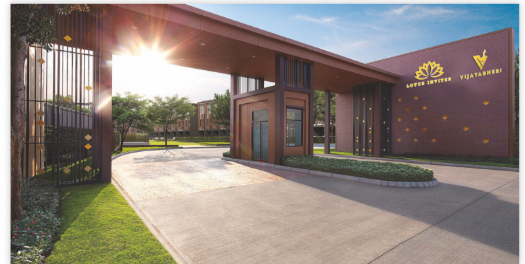
*INDICATIVE PICTURE OF ARCH AT ENTRANCE